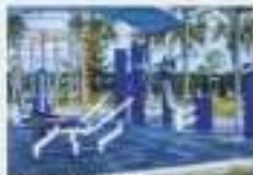
Open Air Gym