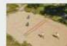
Beach Volley Ball Court