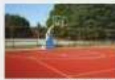
Basket Ball half court